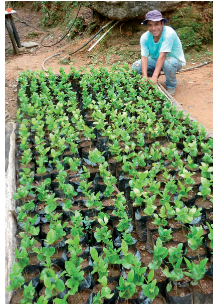
Rio Chiquito tree nursery in Guatemala