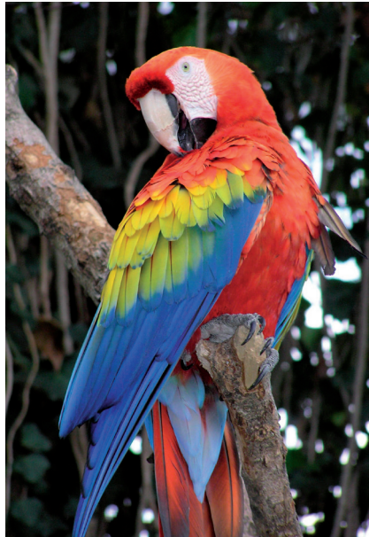
Macaw in its natural habitat, image © OroVerde